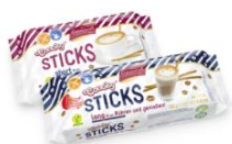
Coooky Sticks (long & short) Coppenrath Feingebäck GmbH

After saving your products, Koelnmesse approves the created products at regular intervals (max. within 3 days) so that they are visible to every visitor. The released innovations are displayed as shown in the following image.